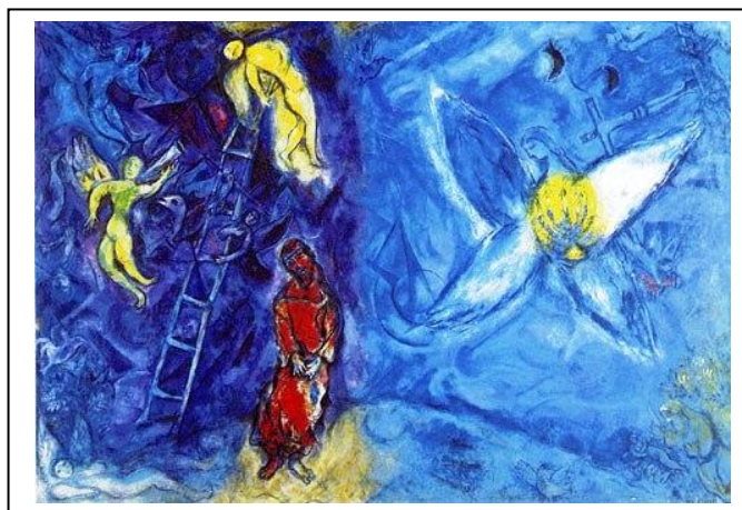
Jacob’s Dream by Marc Chagall

If there was a school for patriarchs, one has to wonder about the criteria for acceptance. A family of tent dwellers was comprised of parents who played favorites with their twin boys, pitting them against one another. Their impetuous older son, Esau, bedded the local beauties, while their quiet younger son, Jacob, plotted betrayal and deception against his brother and father. The story turned dark in Genesis 27 forcing Jacob to flee for his life. But as the reader and Jacob soon discover, the Lord does some of his best work in the darkest moments of life. Read the passage and reflect on the questions below.